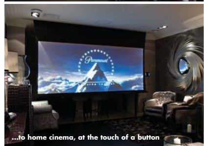
...to home cinema, at the touch of a button